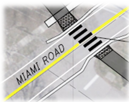
Figure 2: Curb Bump-outs at Pedestrian Crossing

Implement traffic-calming measures near the base of the hill.