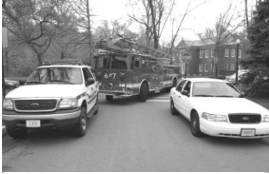
Photo above shows fire truck unable to make left-hand turn onto East Center with car parked on north side of street. Below, truck does not have enough space to safety get through cars parked on both sides. One can see that if cars are parked on both sides, the truck cannot get through.