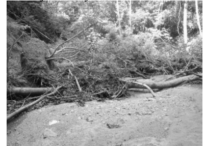
One of the Many Blocked Areas in Creek