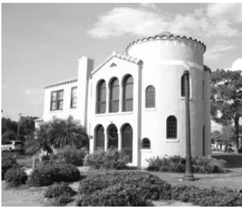
Triangle Inn Museum Building Venice, Florida