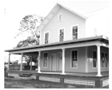
Lord-Higel House Venice, Florida